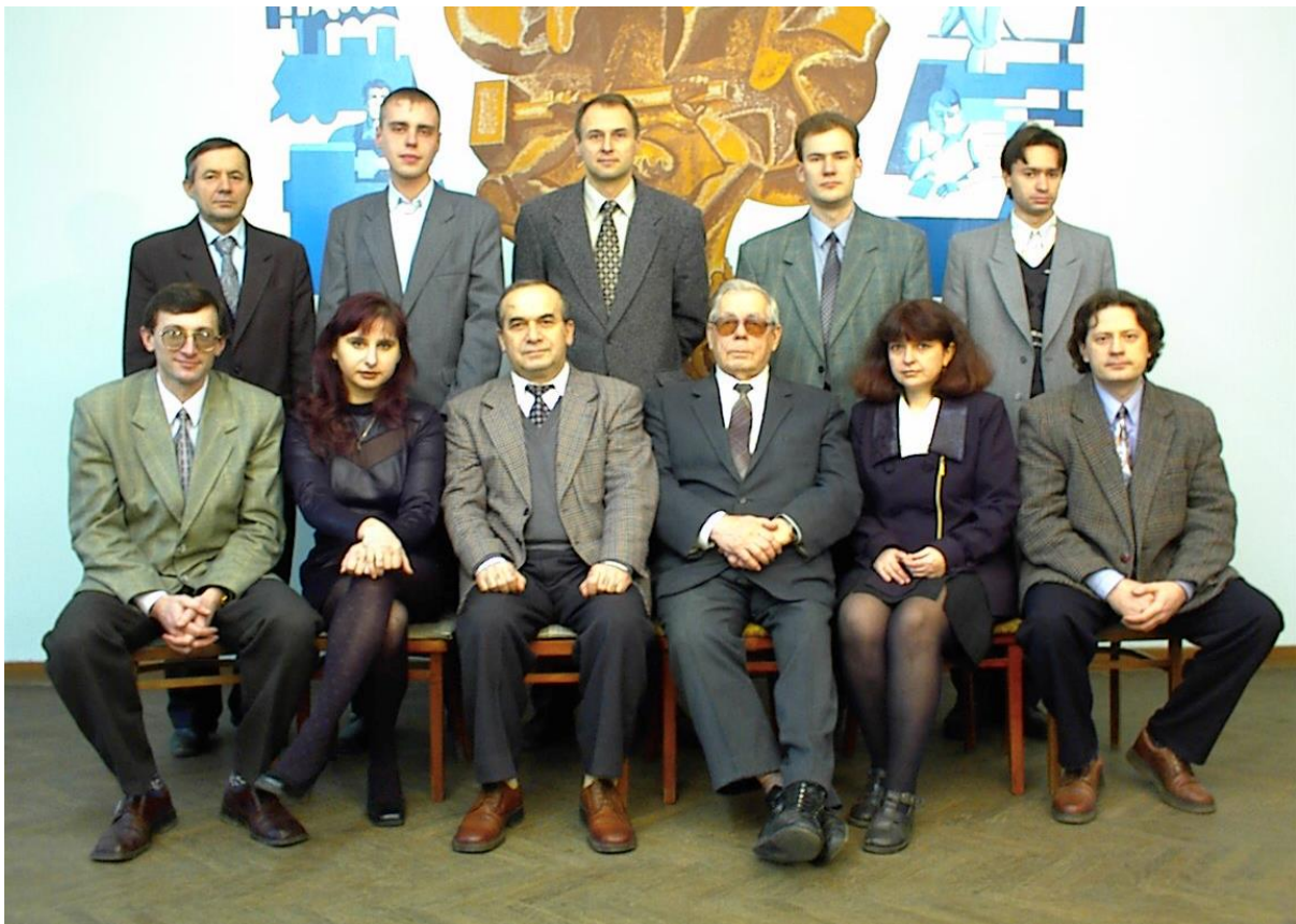
The staff of Metal Forming Department, 1999 year

Metal Forming Department turned into a major center for the development of forming processes – a kind of creative laboratory, in which the scientific team of like-minded people carried out research and development work in various directions.